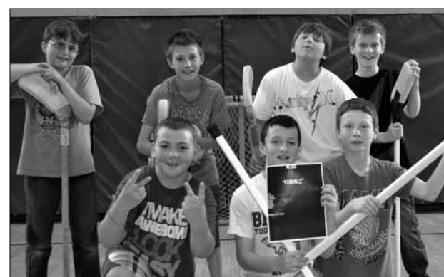
Floor hockey was one of many "Clipper Carnival" activities.

"We made up a list of events, both inside and outside, that would be appropriate for all ages and get all the students involved," she said.