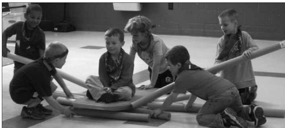
Teamwork was needed to keep this student rolling along.