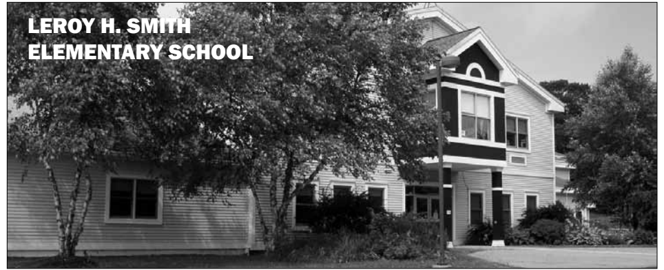
LEROY H. SMITH ELEMENTARY SCHOOL

We are having an open house for Kindergarten, Tuesday, August 27 from 6-7 p.m. Children will have the opportunity to meet their teacher and explore their room. At