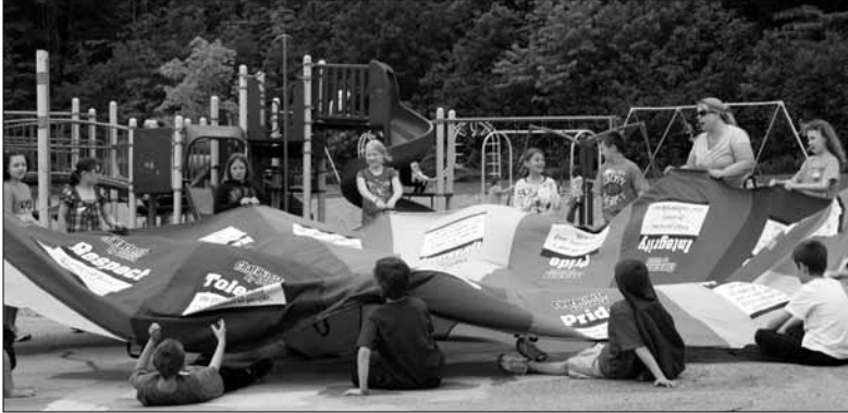
Winterport and Frankfort students enjoy Field Day activities at Smith School.

Our annual field day at Smith School took place on June 7.