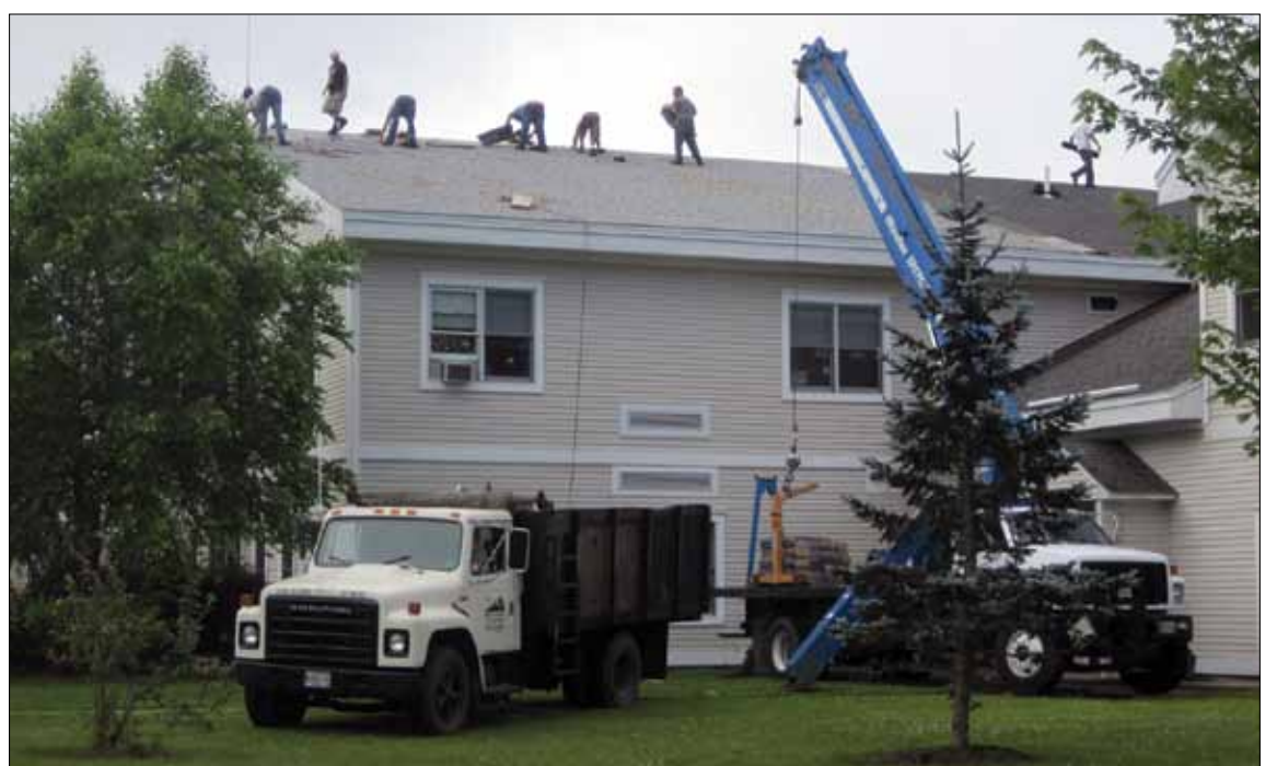
NEW ROOF AT SMITH SCHOOL —Workers from Roof Systems of Maine install a new roof on Leroy H. Smith School as part of a series of improvements funded by a QSAB bond issue that was approved by voters on June 11. The bond also funded security improvements at three RSU 22 schools. Story on page 4.