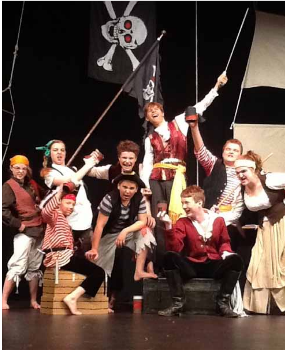
A group of pirates on stage at the Hampden Academy Performing Arts Center for Gilbert and Sullivan's comic operetta 'Pirates of Penzance Junior.'

RSU 22 • Hampden • Newburgh • Winterport • Frankfort 24 Main Road North, Hampden, ME 04444 August 2013