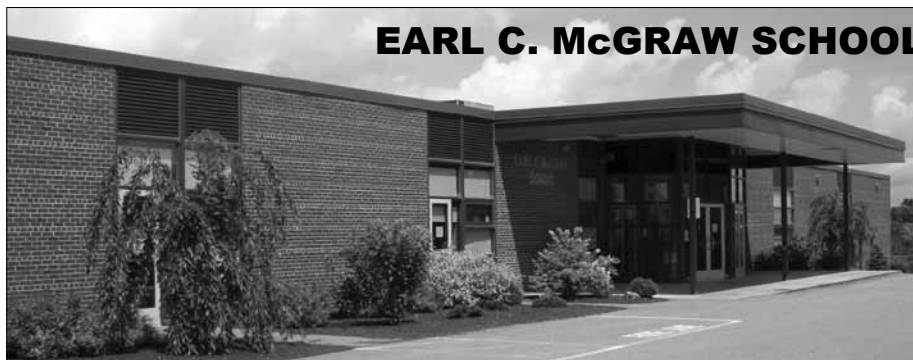
EARL C. MCGRAW SCHOOL

We will have an Open House on August 28. The kindergarten children and parents should come at 4 p.m. to the gym, where I will give you a few updates, you will have a bus safety training