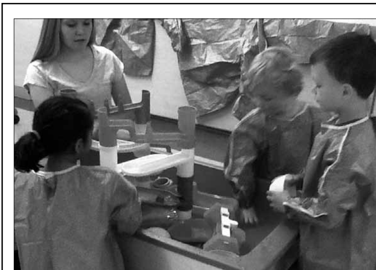
Learning about water movement.

* 3 storm days are included and may alter closing date