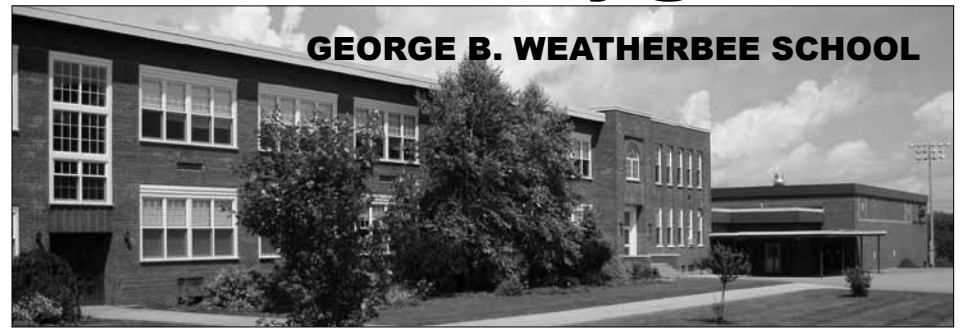
GEORGE B. WEATHERBEE SCHOOL